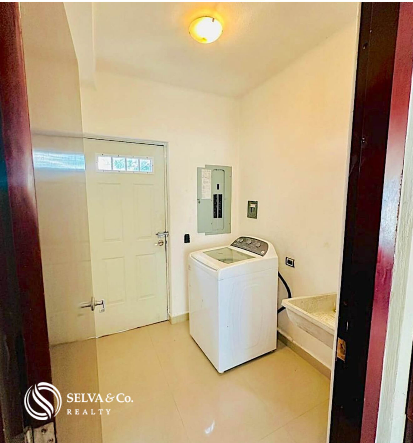
Area de Lavado Laundry room