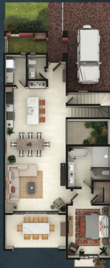
TOP FLOOR PISO SUPERIOR