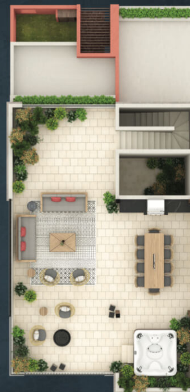
ROOF GARDEN TERRAZA ROOFTOP