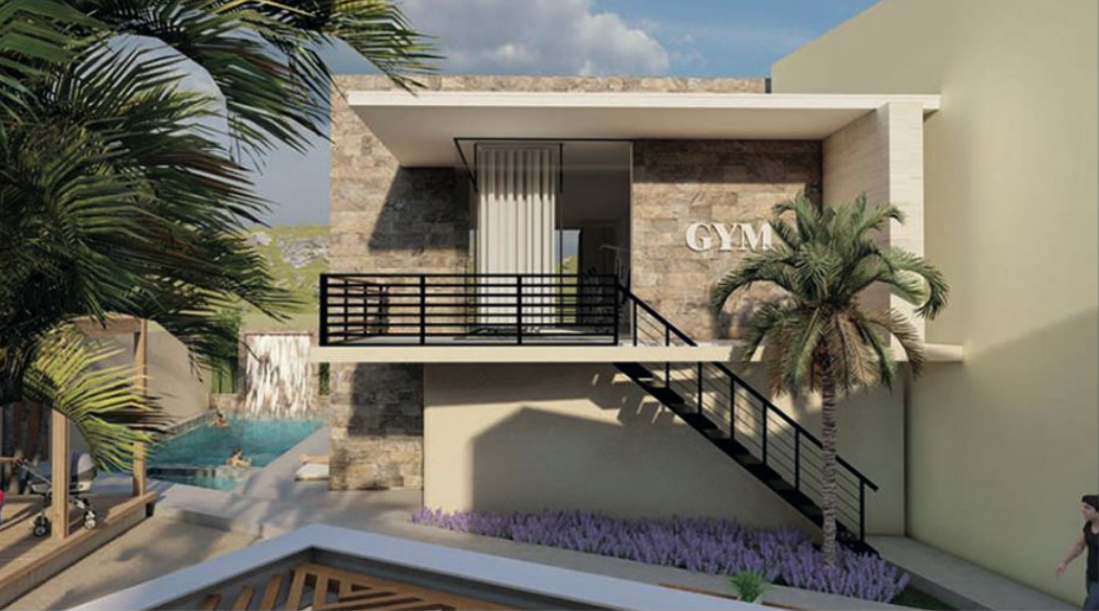
Gimnasio y alberca Pool & Gym