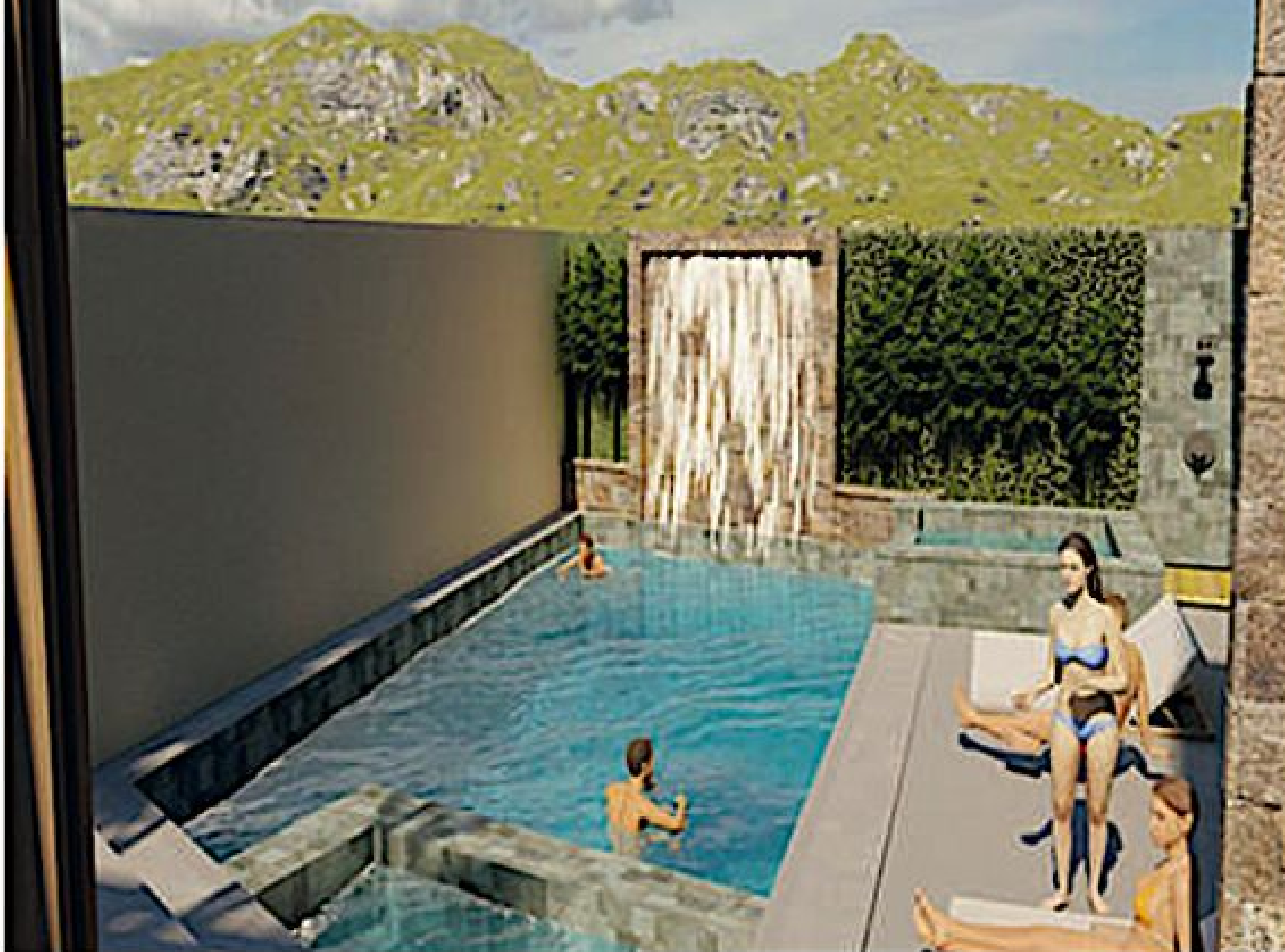
Alberca y jacuzzi Pool & jacuzzi