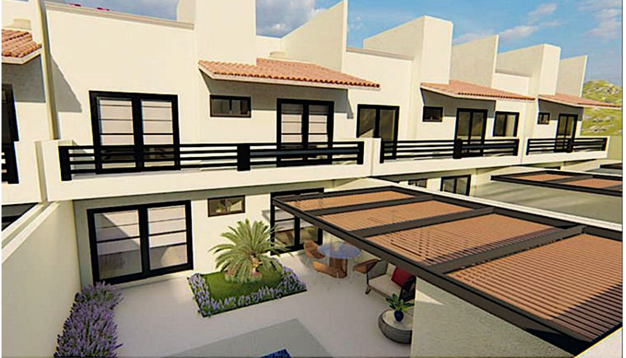
Terraza semi techada Semi roofed terrace