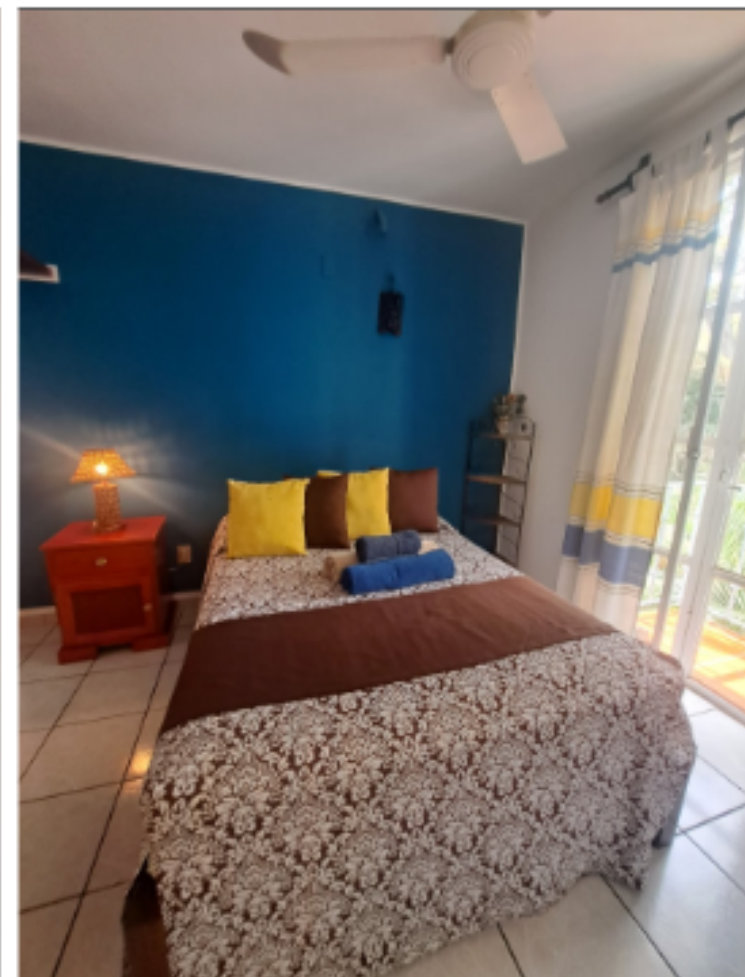
Recamara principal Main bedroom