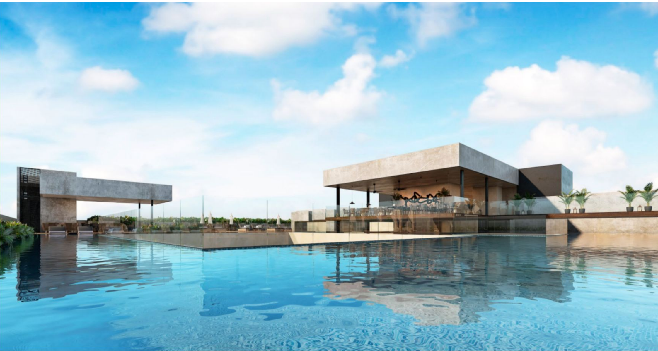
Alberca infinity y pool bar con vistas panorámicas Infinity pool & pool bar with panoramic views