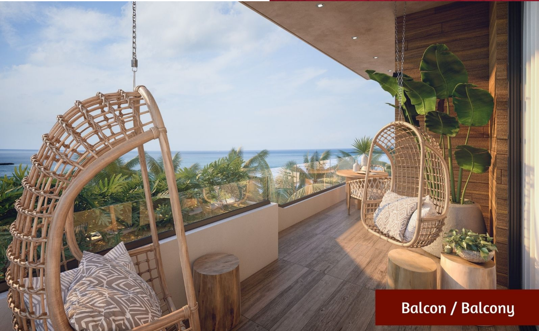
Balcon / Balcony