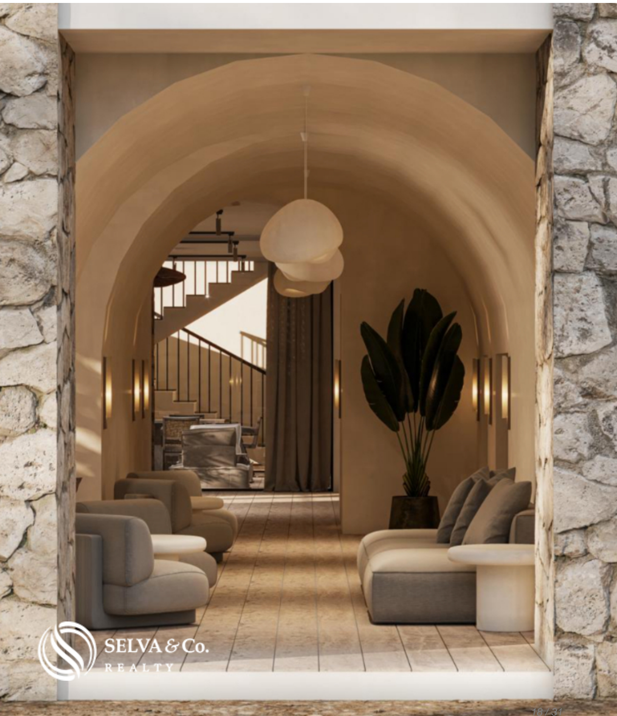
Lobby de acceso Access lobby