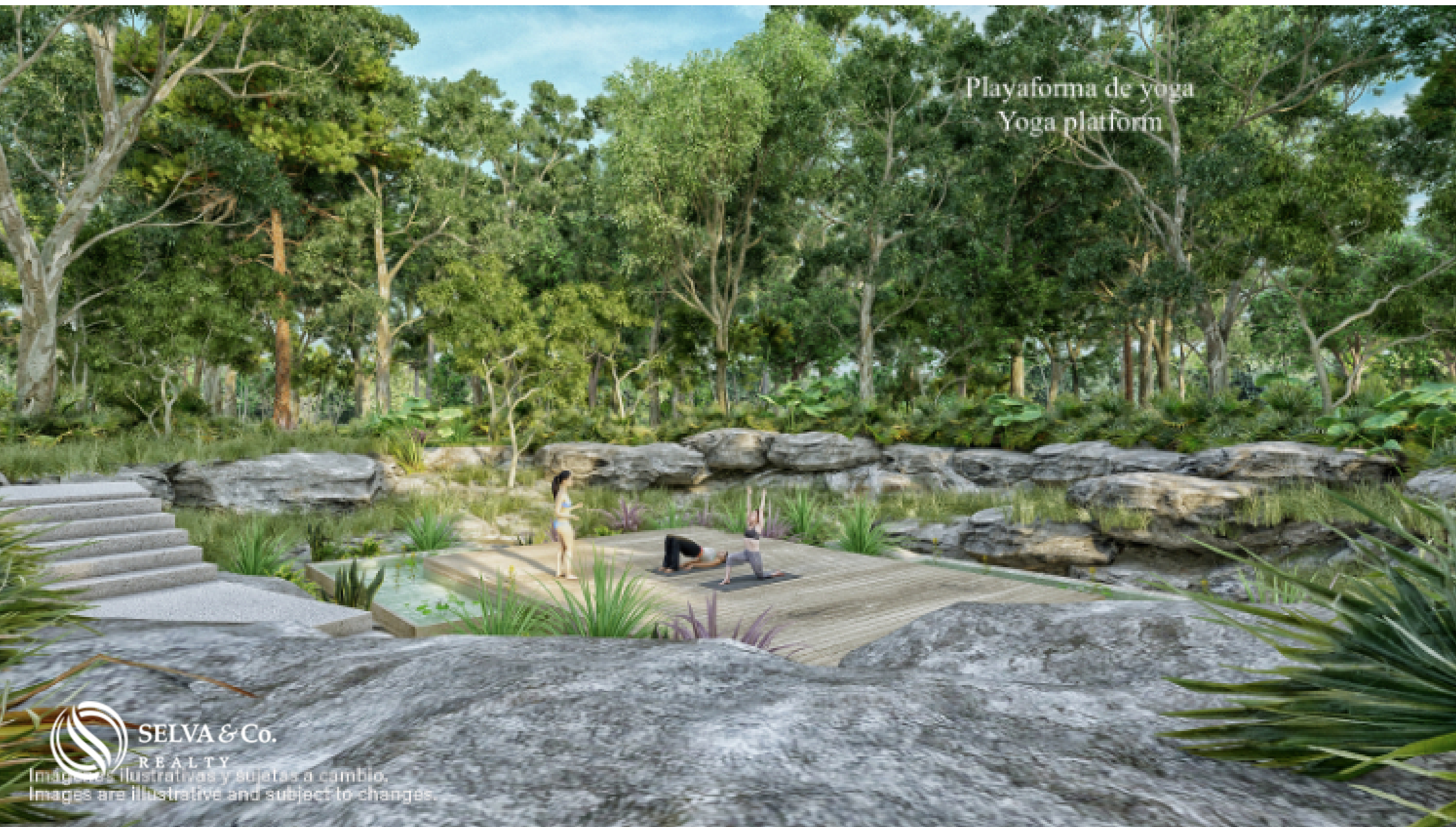
Playaforma de yoga Yoga platform