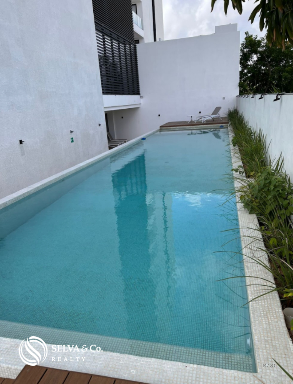
Alberca Swimming pool