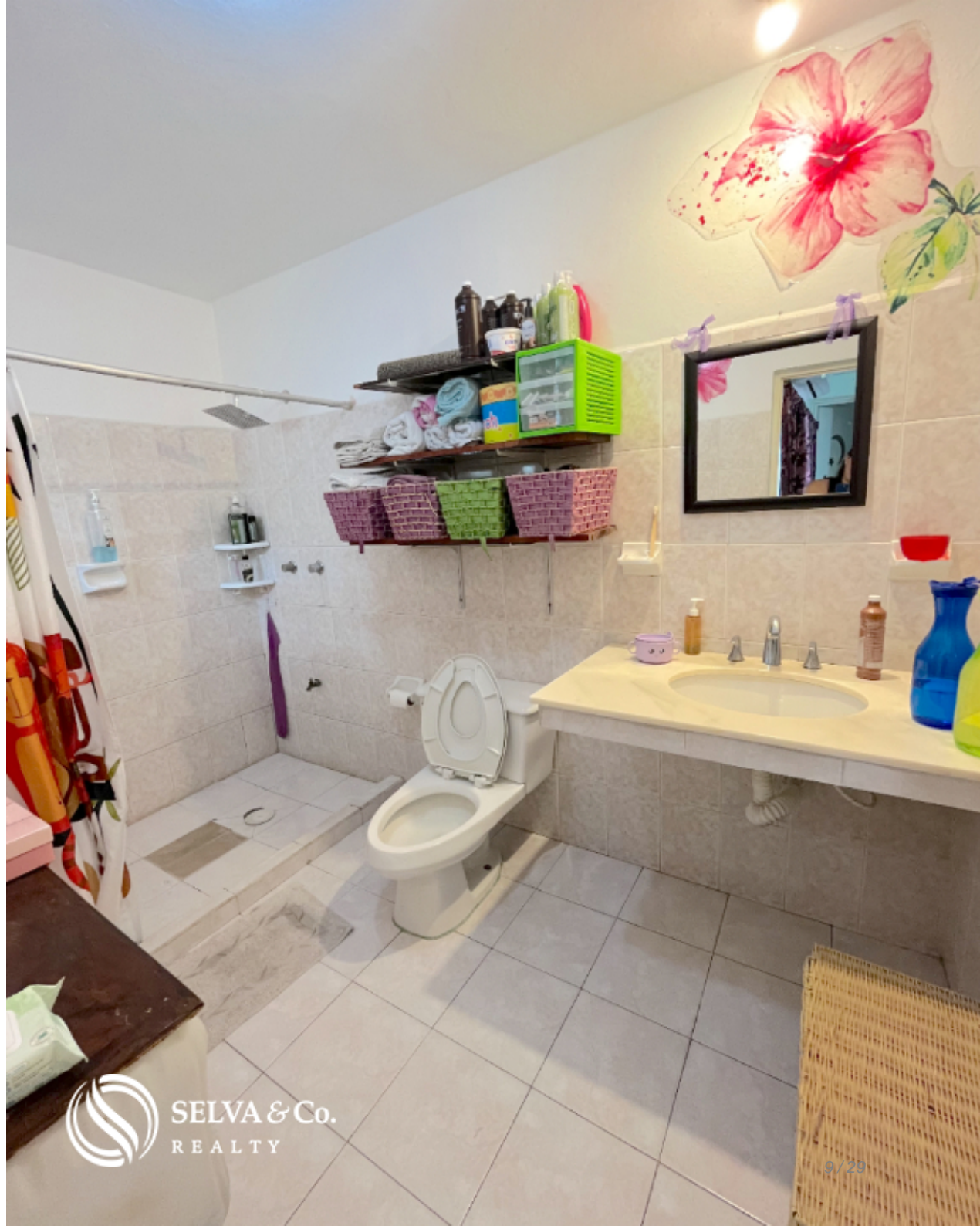
Baño amplio Wide Bathroom