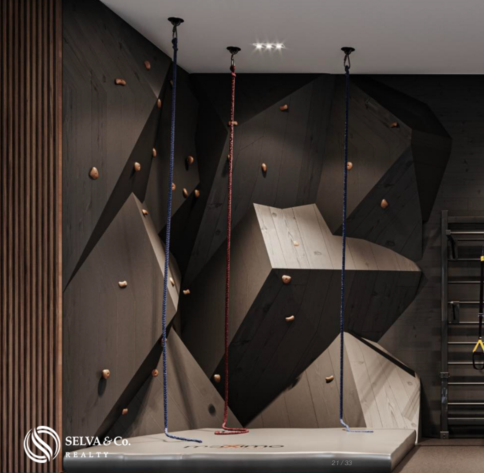
Muro de escalar Climbing wall