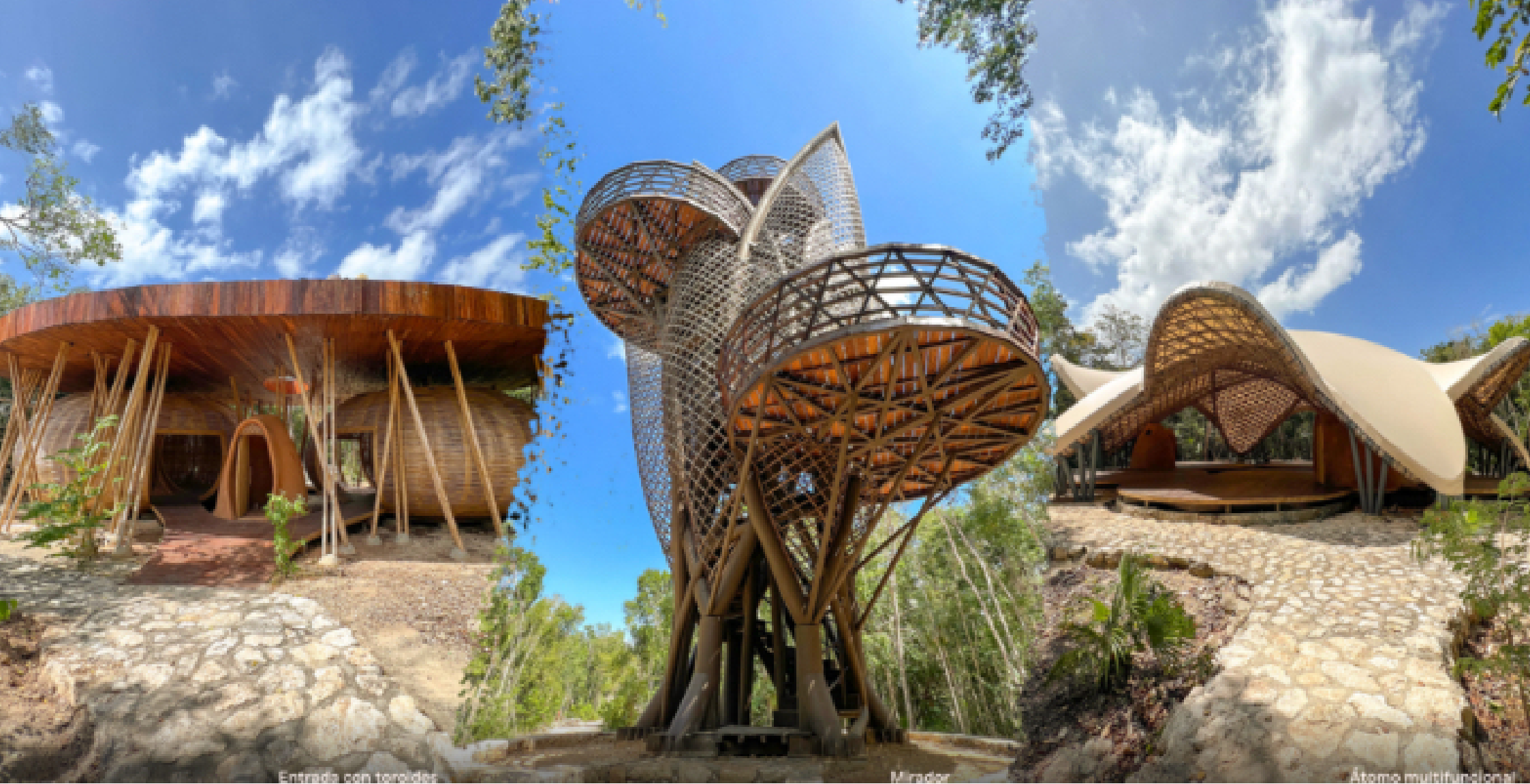
Entrada con torresitas