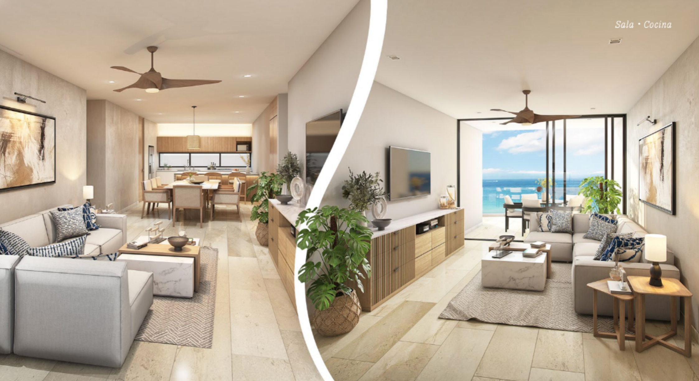
Sala - Cocina