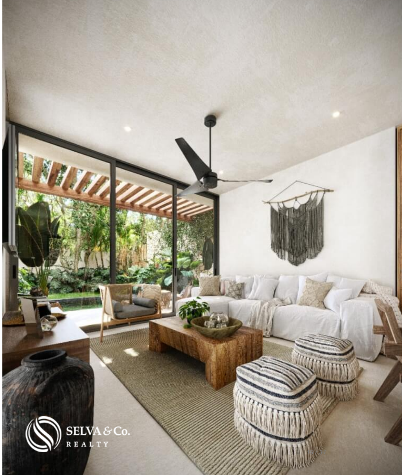
Sala con ventana de pared completa Full wall window in living room