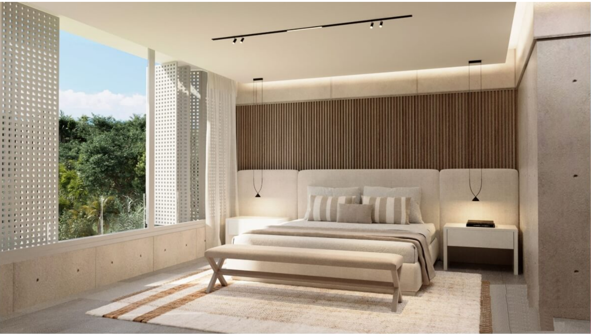
Ventanas de piso a techo Floor to ceiling window