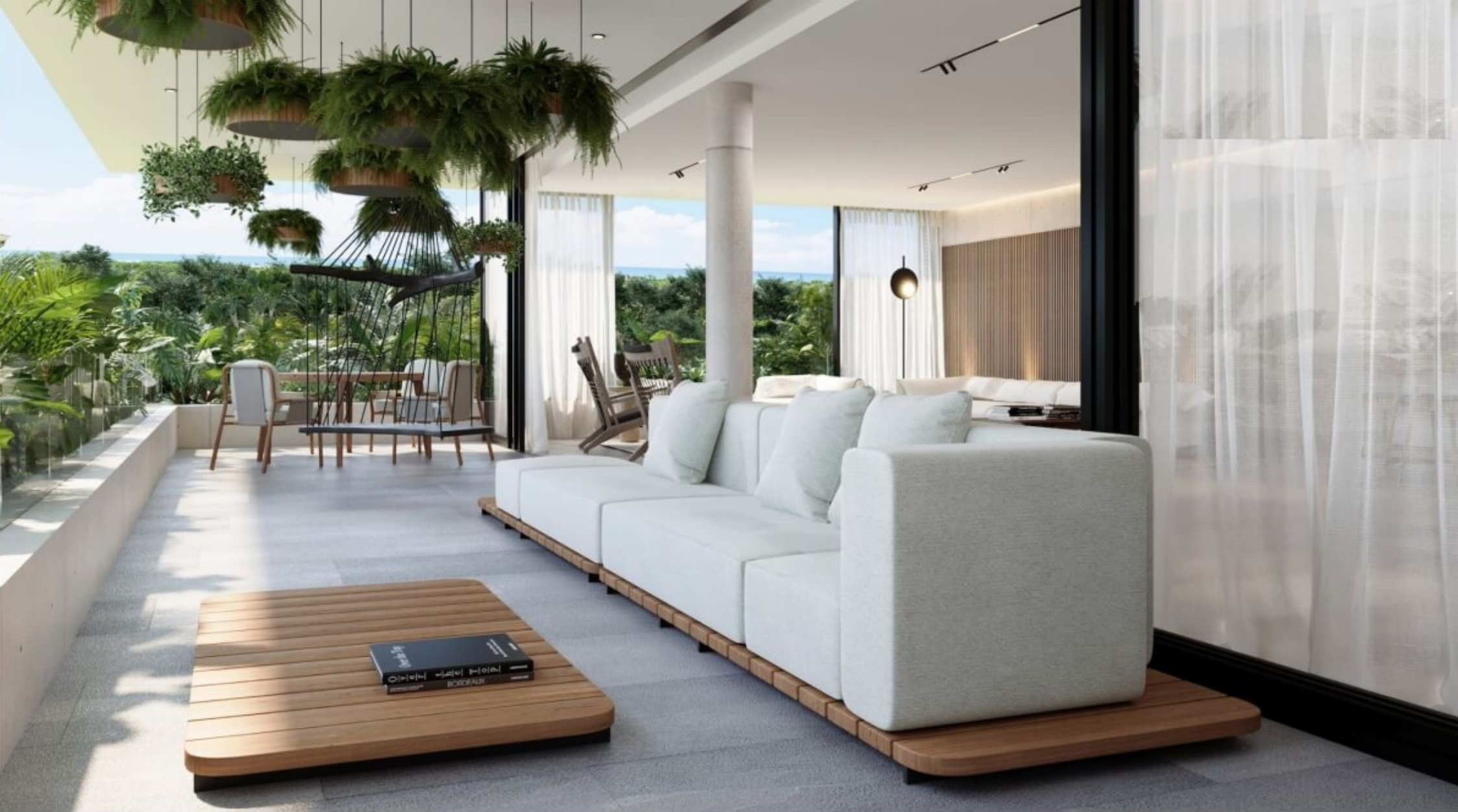
Terraza amplia, estilo de vida interior-exterior Wide terrace, indoor-outdoor lifestyle