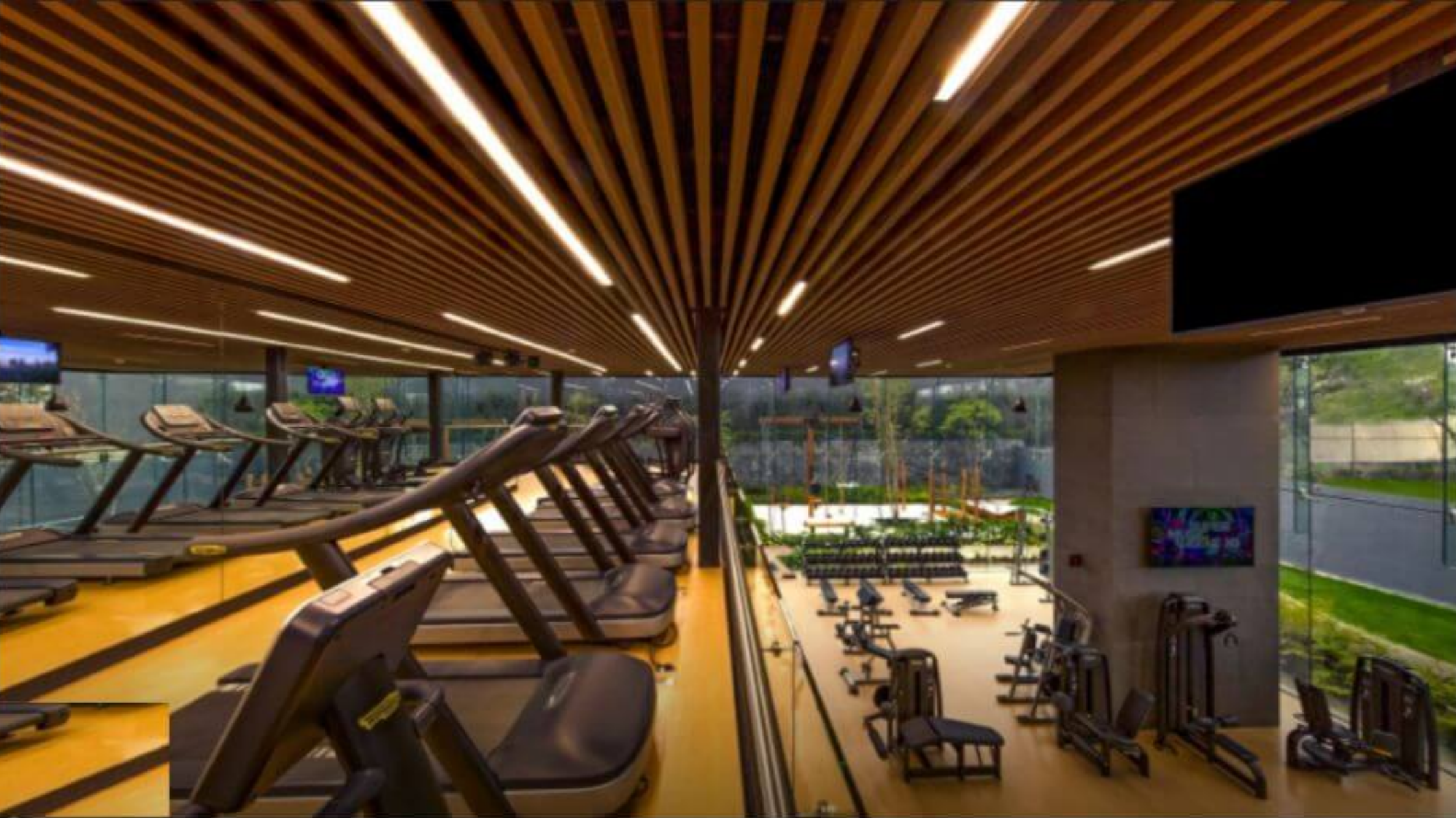
Gimnasio interior y exterior Indoor & outdoor gym