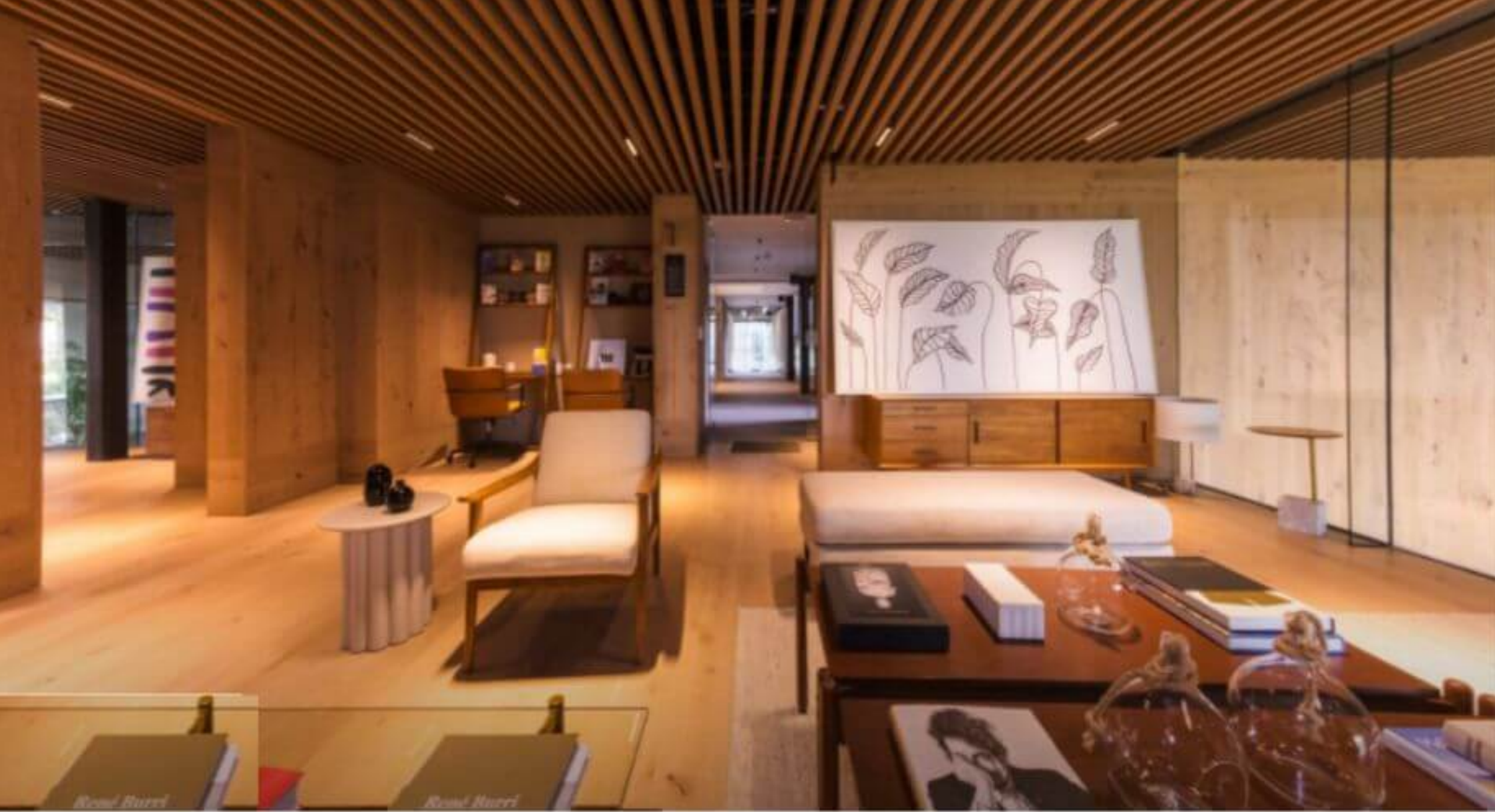
Area de coworking y centro de negocios Coworking and business center