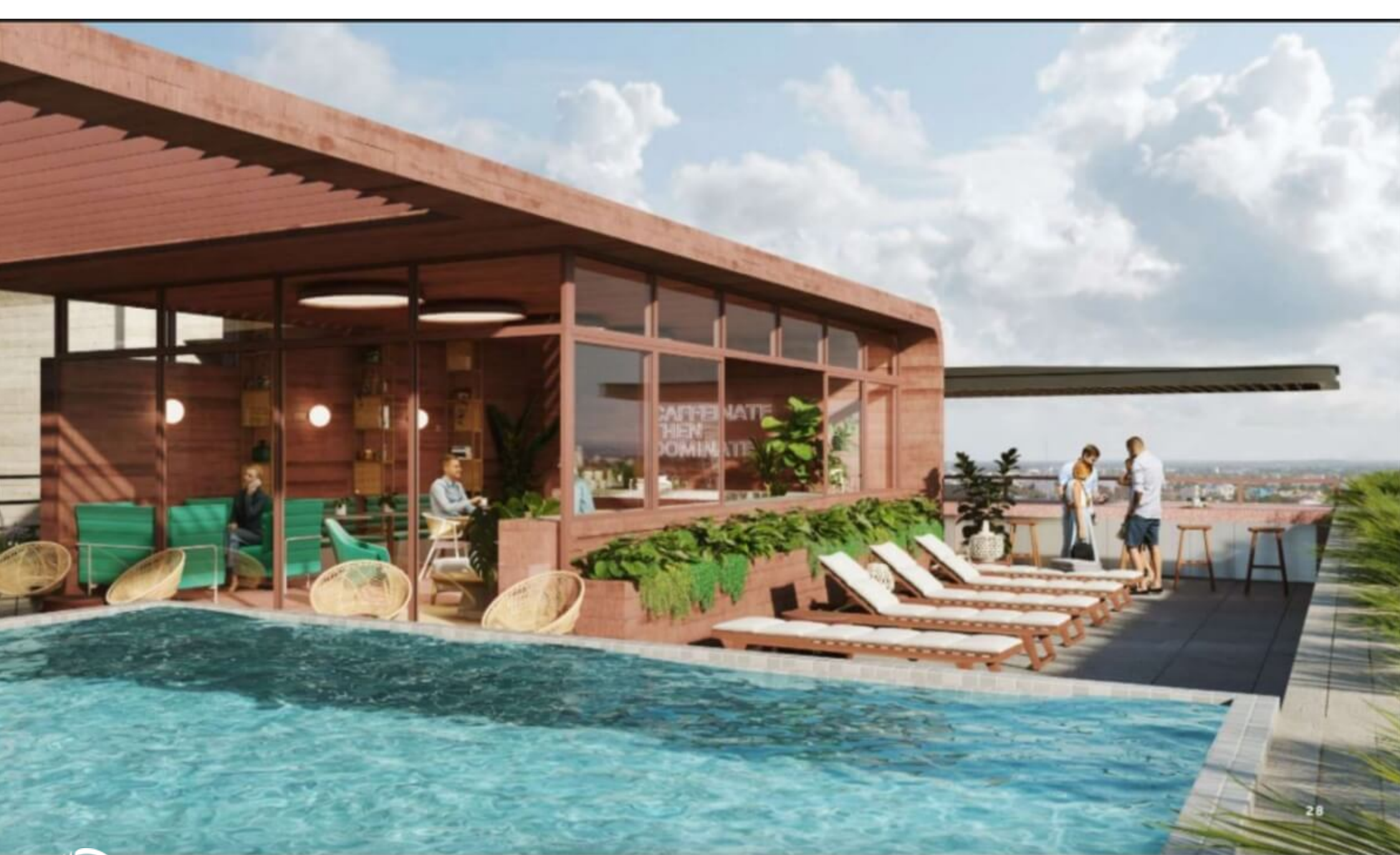
Coworking con zona interior y exterior Indoor - outdoor coworking space