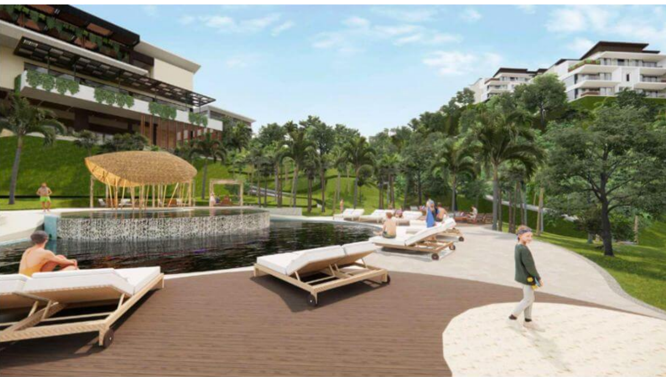
Club de playa Beach club