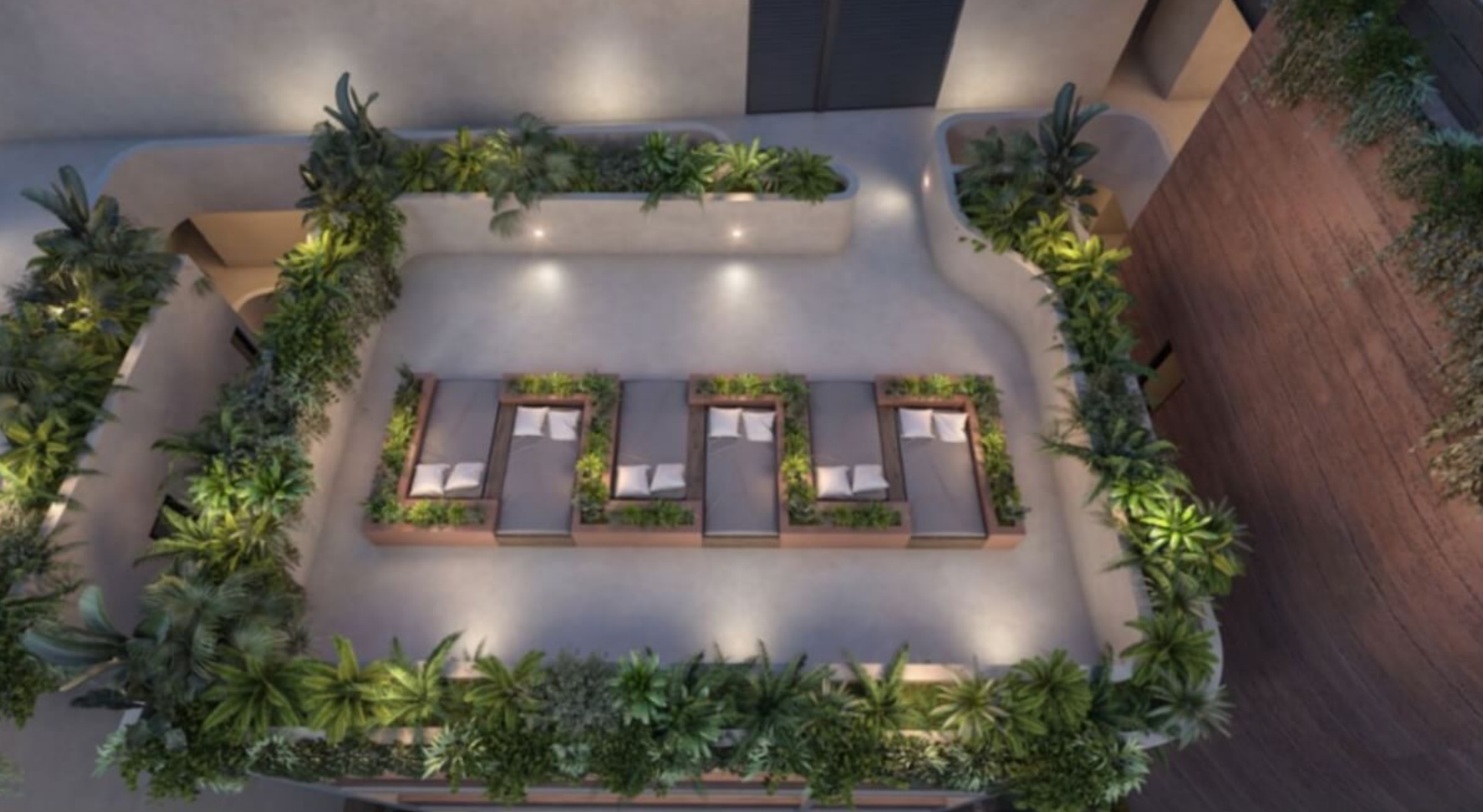
Mirador de estrellas - Star gazer