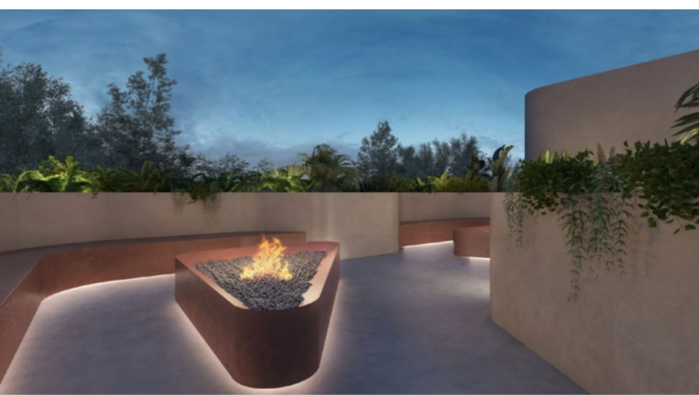
Area de fogata - Fire pit area