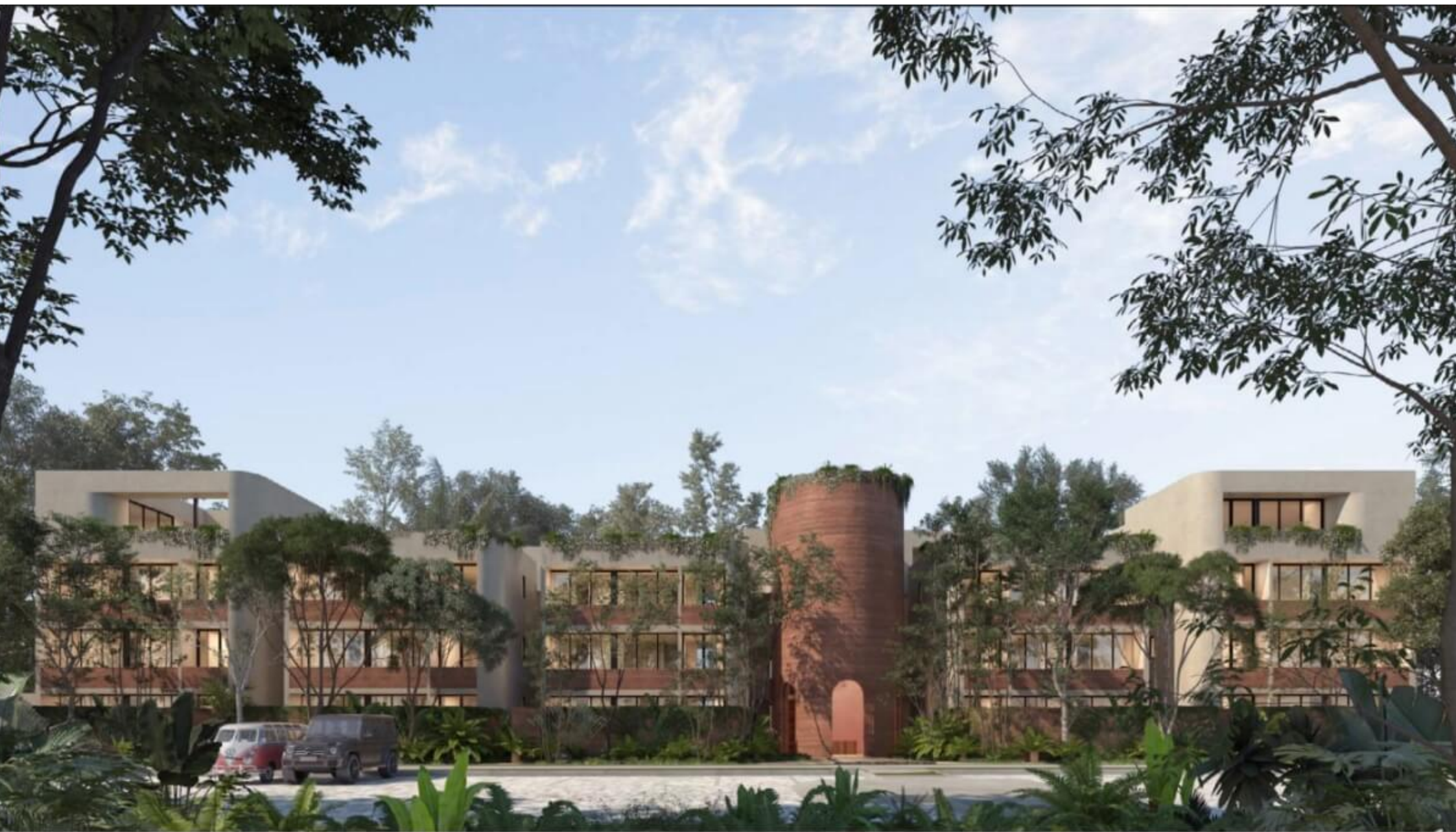
Fachada - Facade