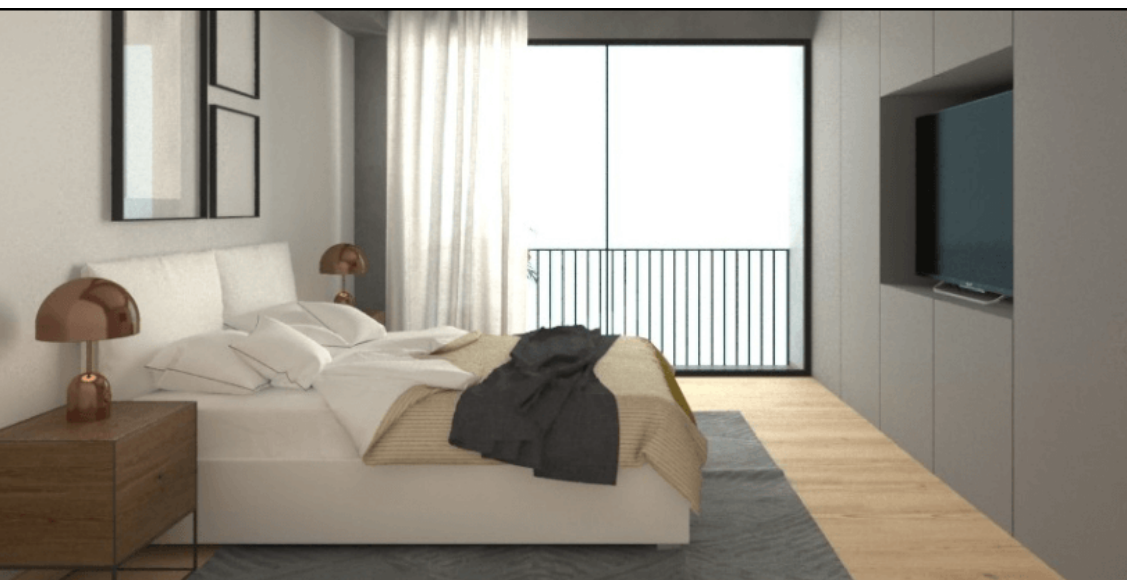
Recamara con ventana de pared completa y balcon Bedroom with full wall window and balcony