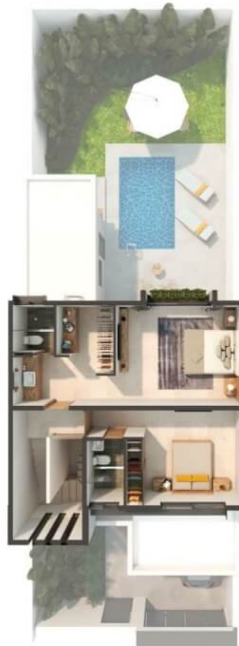
Top floor PLANTA ALTA