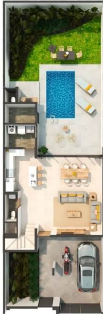
Ground floor PLANTA BAJA