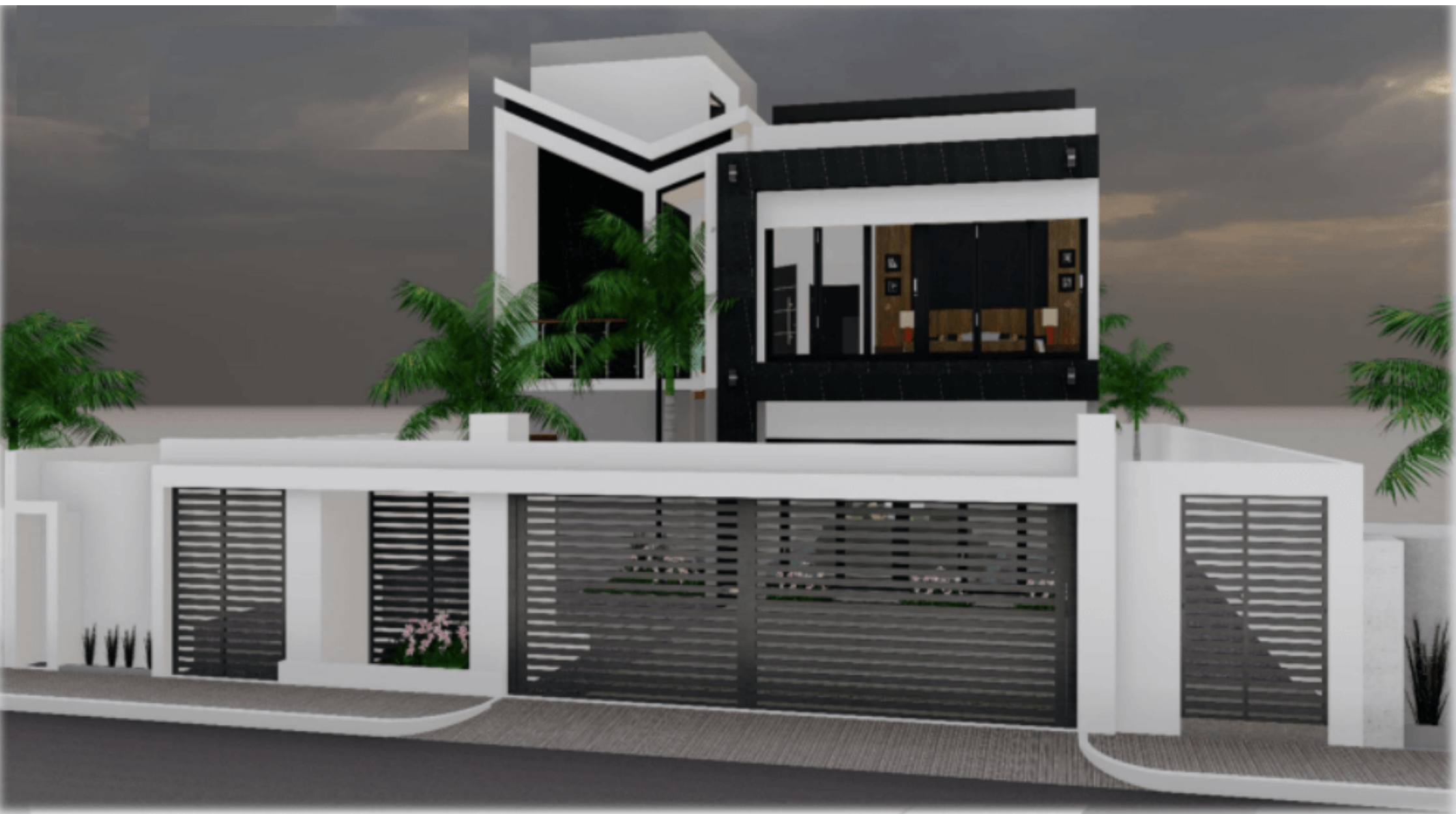
Fachada frontal - Frontal facade