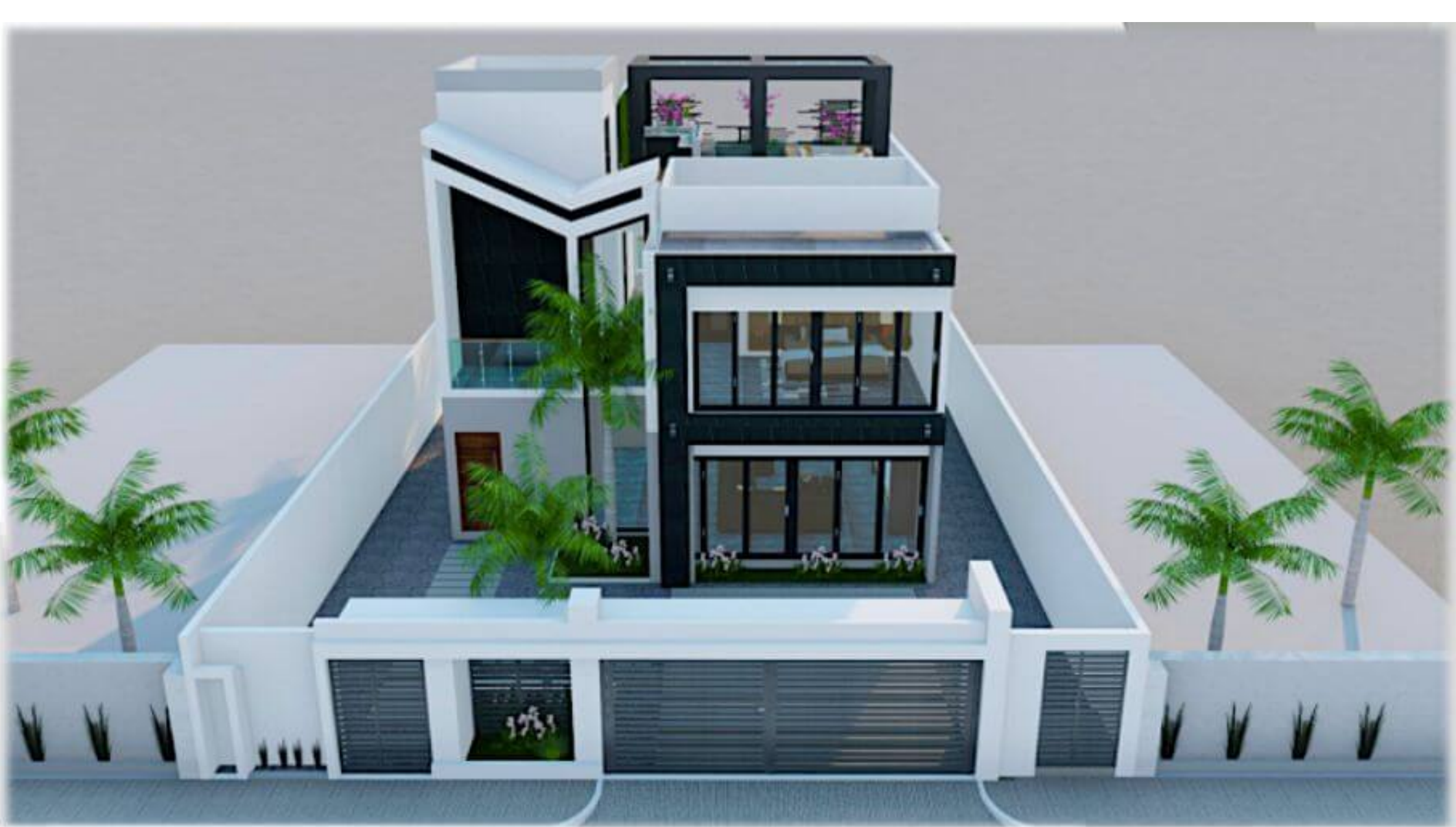
Vista Aeres - Aereal view