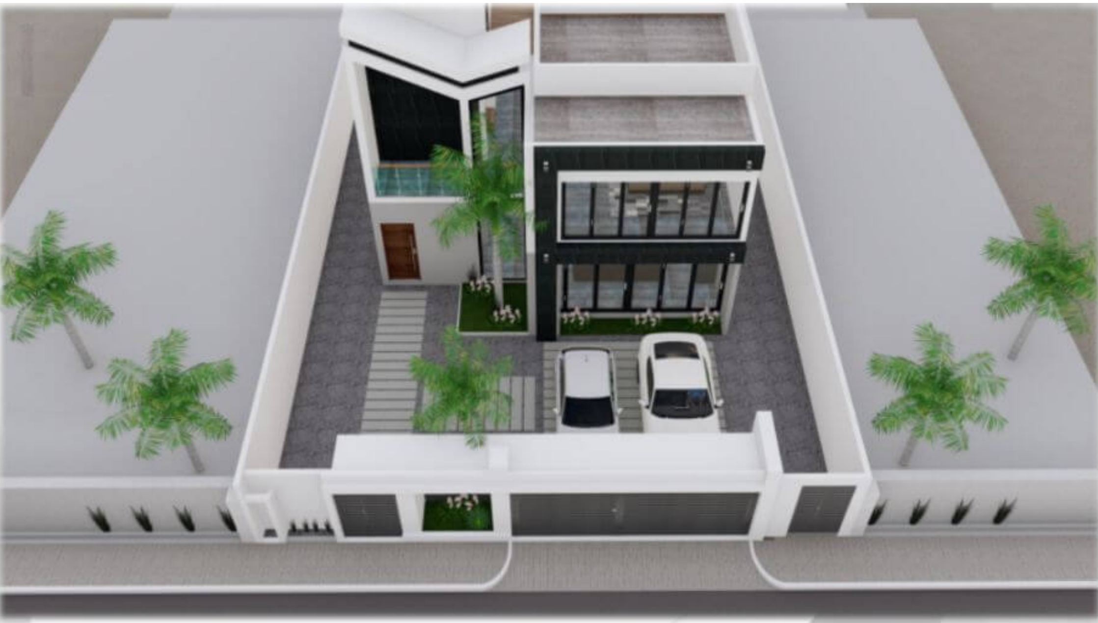
Vista aerea - Aereal view