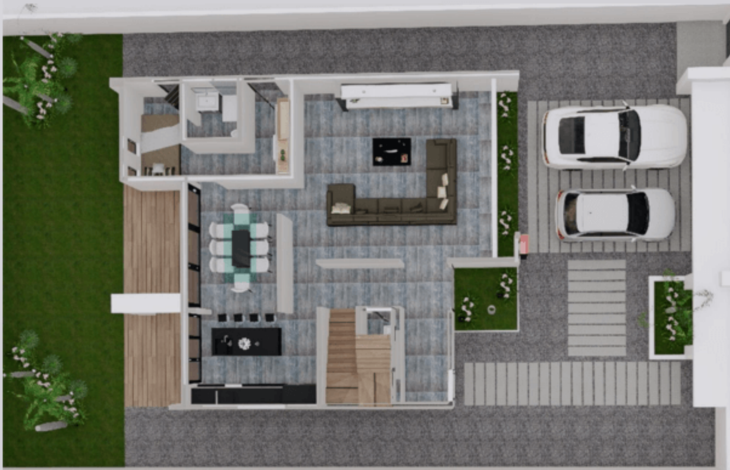
Planta baja - Ground floor