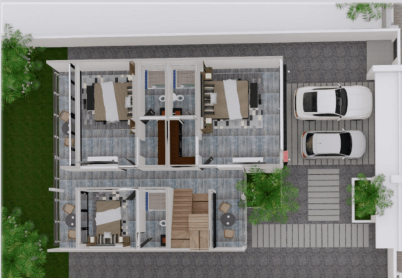
Primer piso - First floor