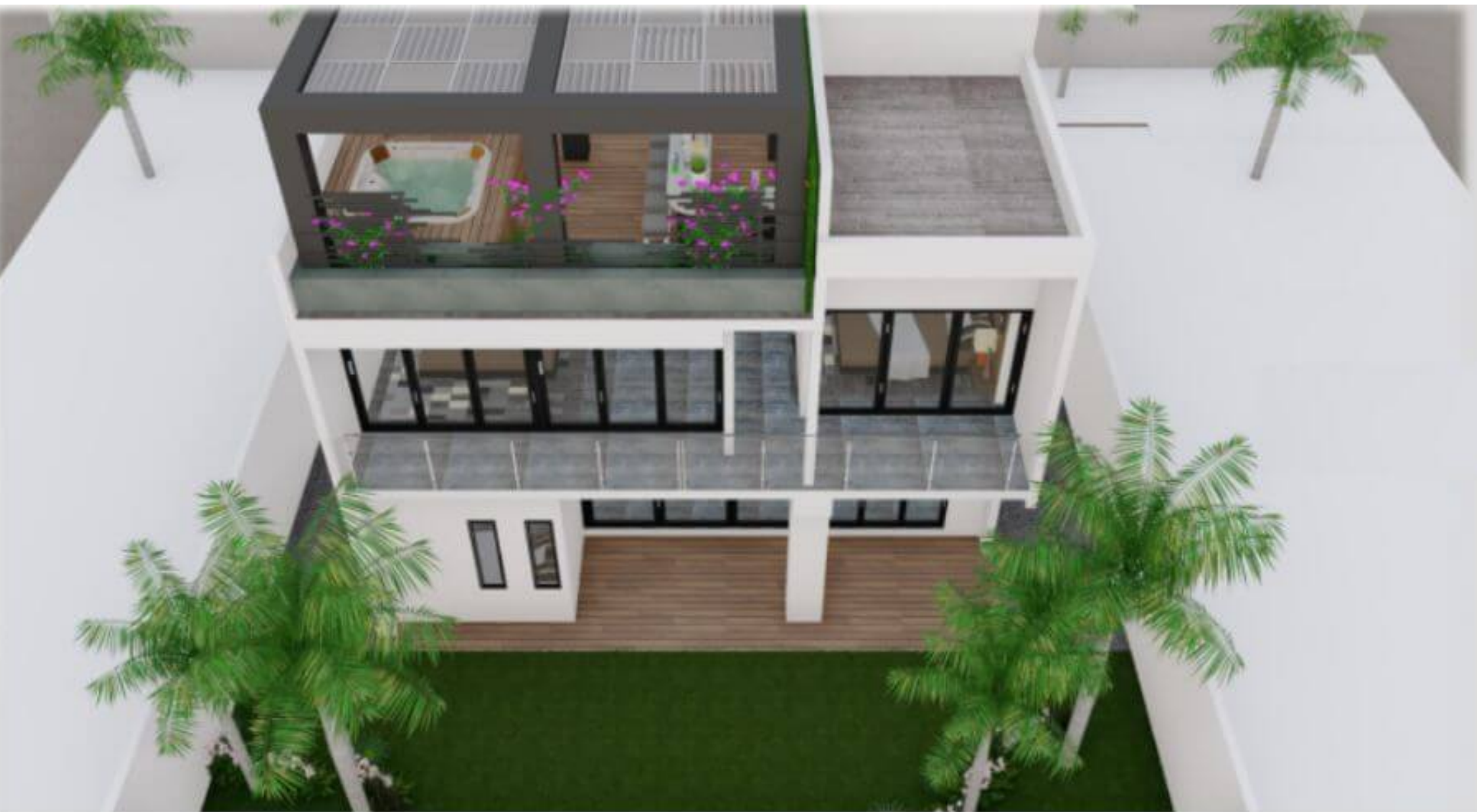
Fachada trasera Back facade