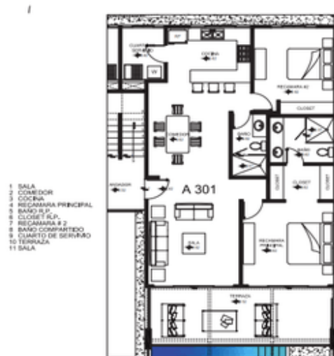
Primer piso First floor