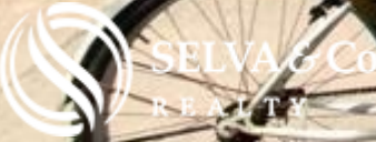
Ciclopista a la playa /Aldea Zama bicycle path