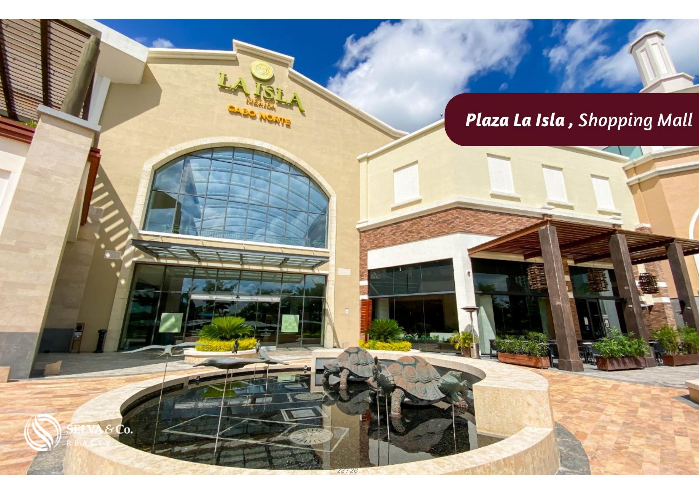
Plaza La Isla , Shopping Mall