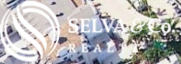
Campo de golf Playacar Playacar golf Course