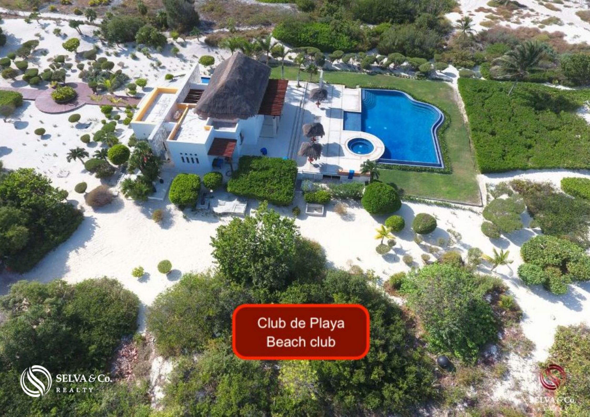
Club de Playa Beach club