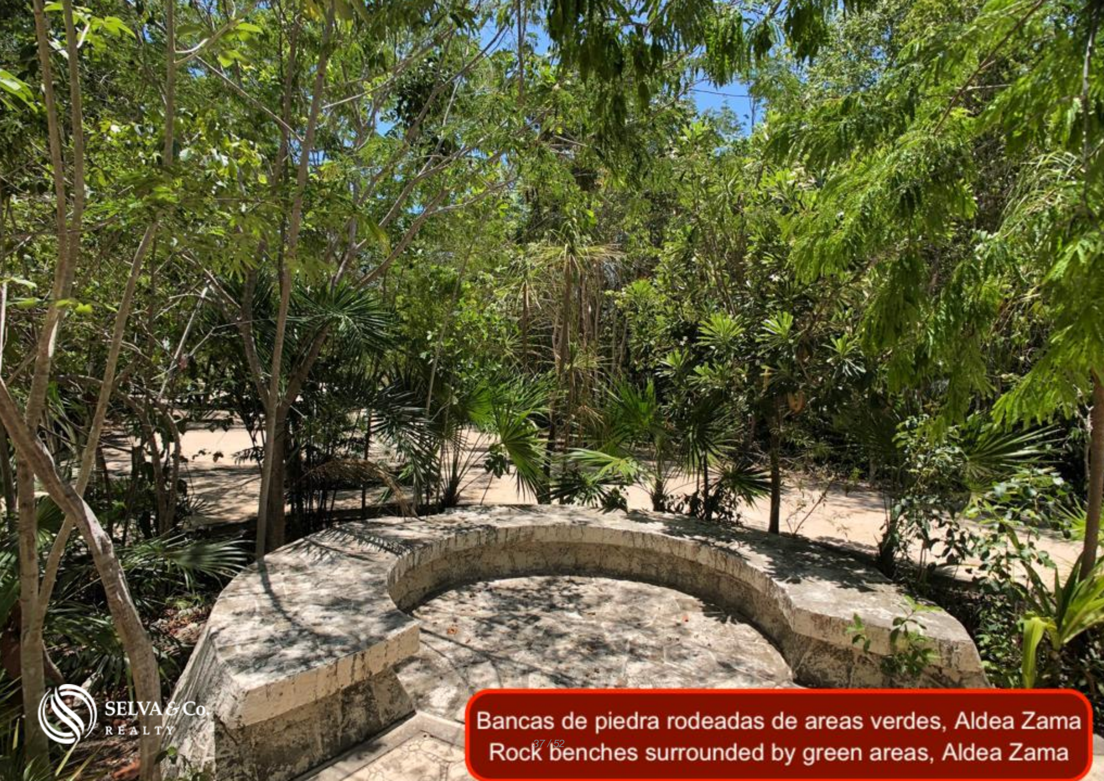
Bancas de piedra rodeadas de areas verdes, Aldea Zama Rock benches surrounded by green areas, Aldea Zama