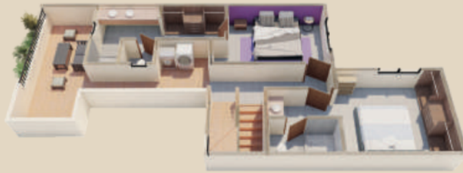
PLANTA ALTA FIRST FLOOR