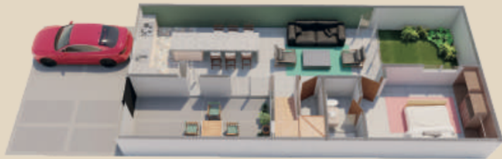
PLANTA BAJA GROUND FLOOR