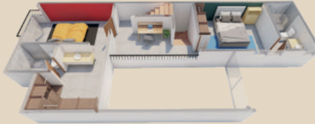
PLANTA ALTA TOP FLOOR