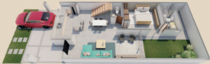
PLANTA BAJA GROUND FLOOR