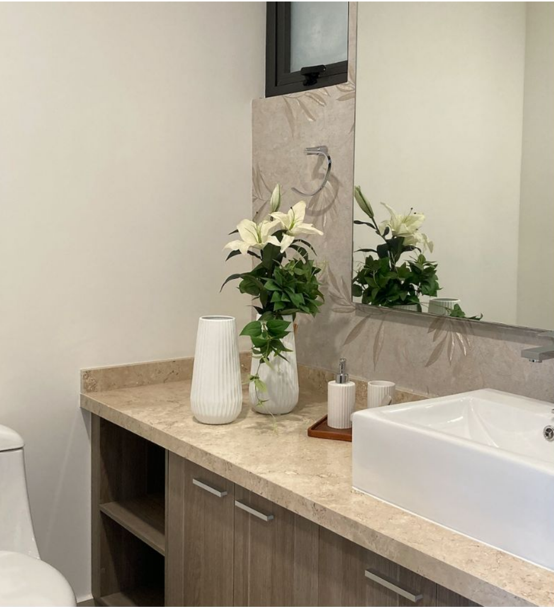
Acabados de baño