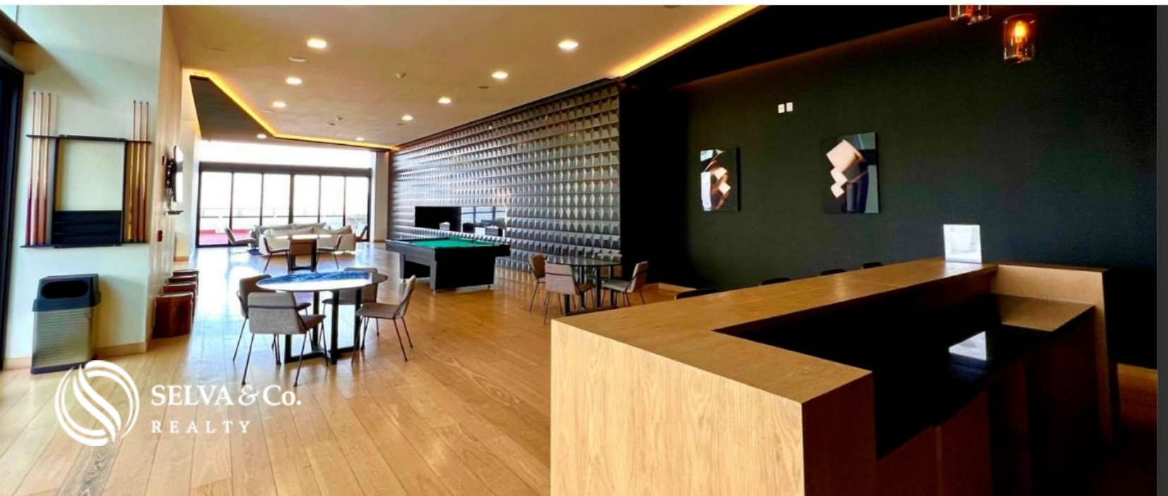
Game room of adults