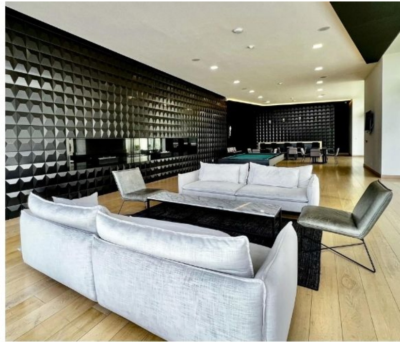
Sala de juegos de adultos