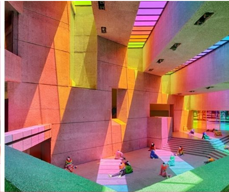
Museo de arte contemporaneo / Contemporary Art Museum