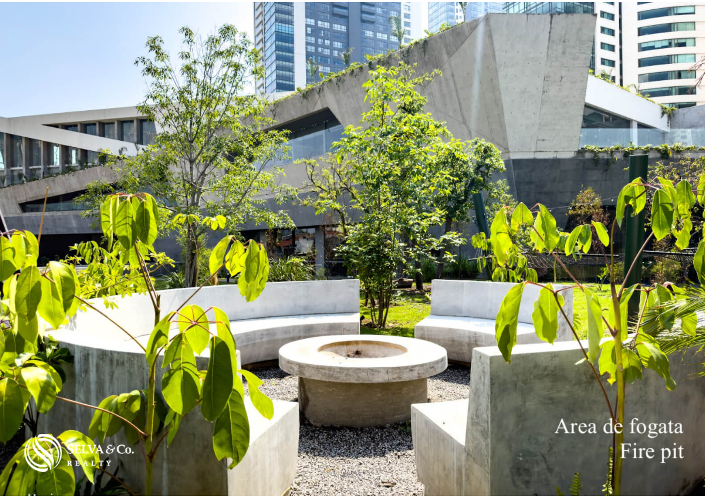
Area de fogata Fire pit