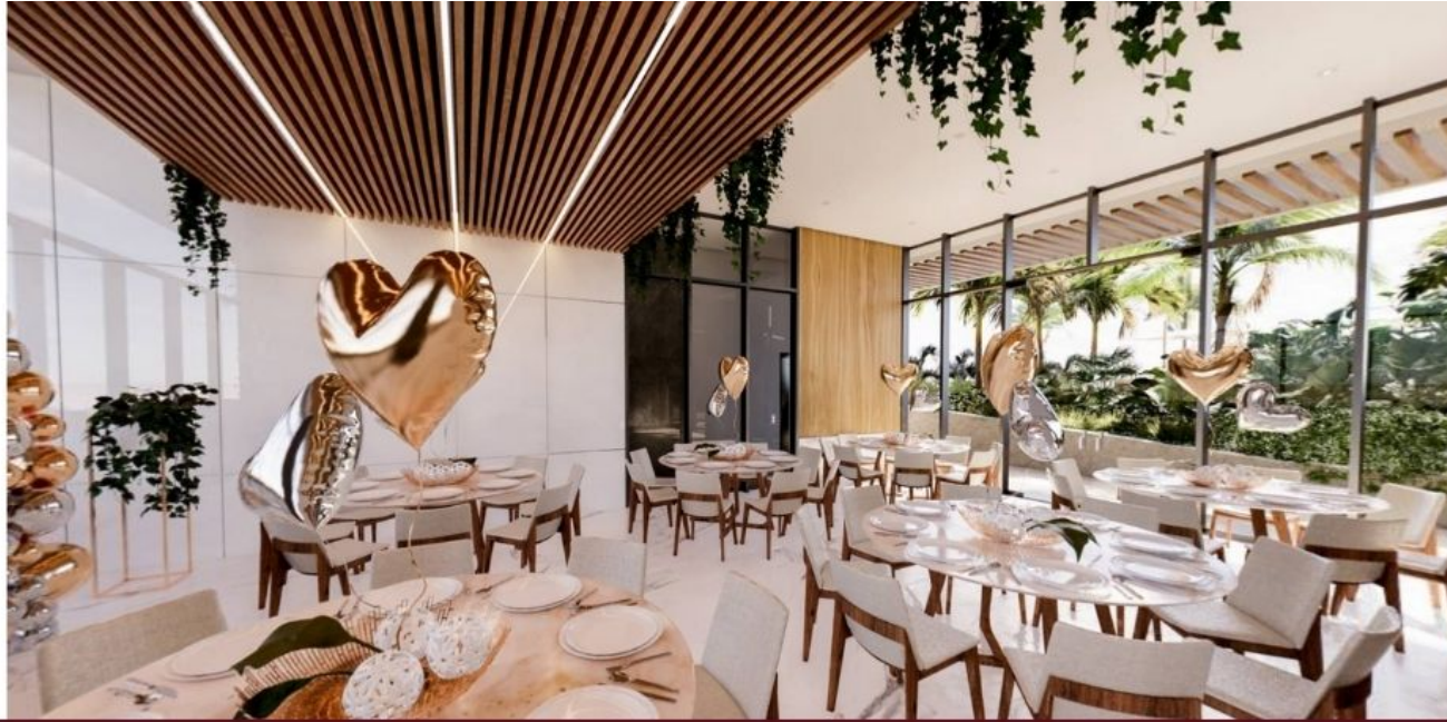
Salon de usos multiples / multipurpose room