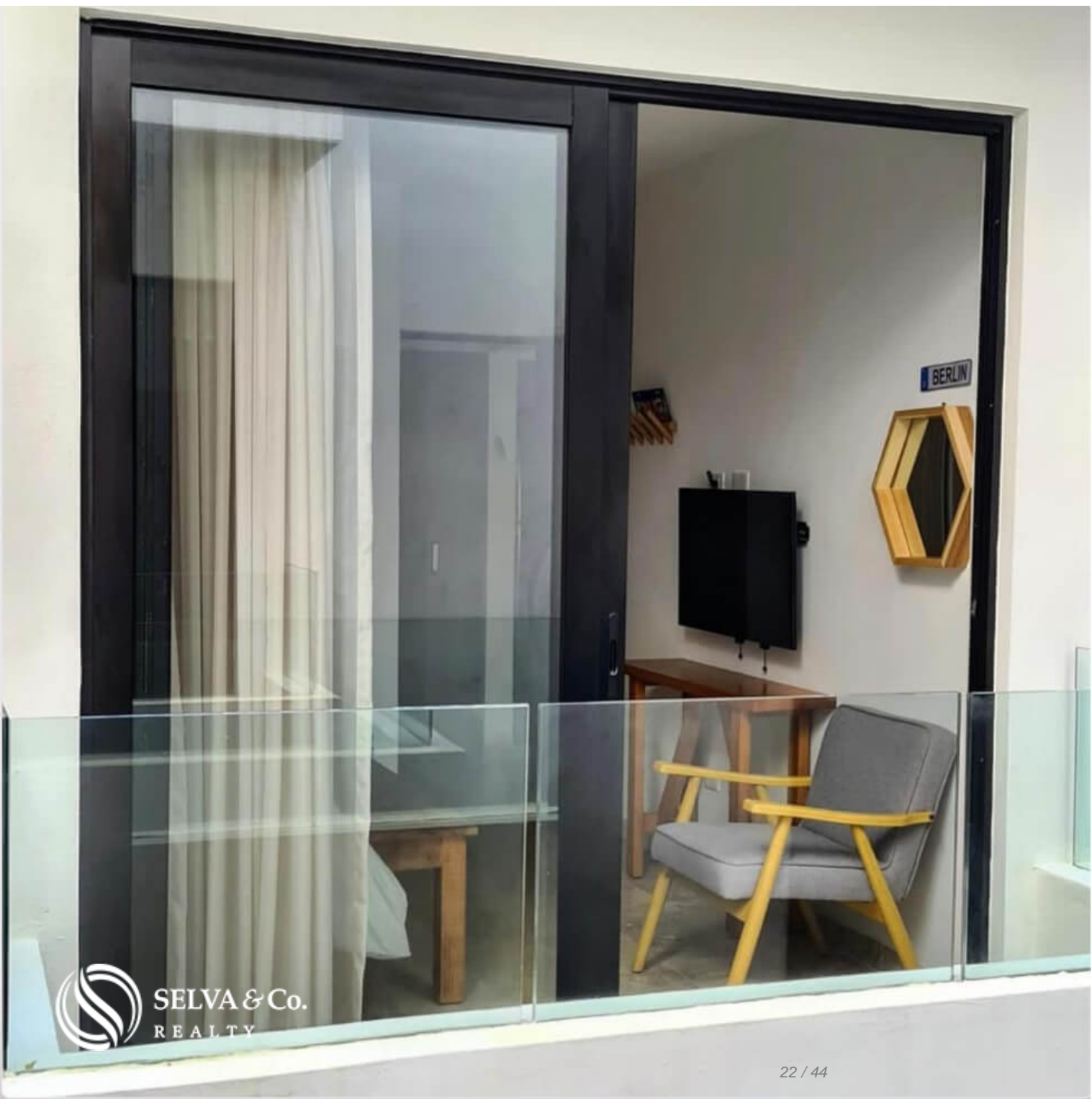
Recamara con balcon