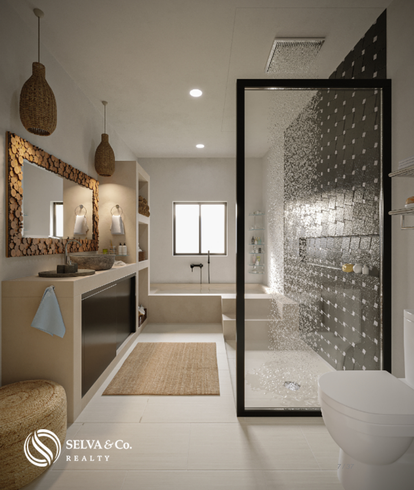
Baño con tina Bathroom with tub