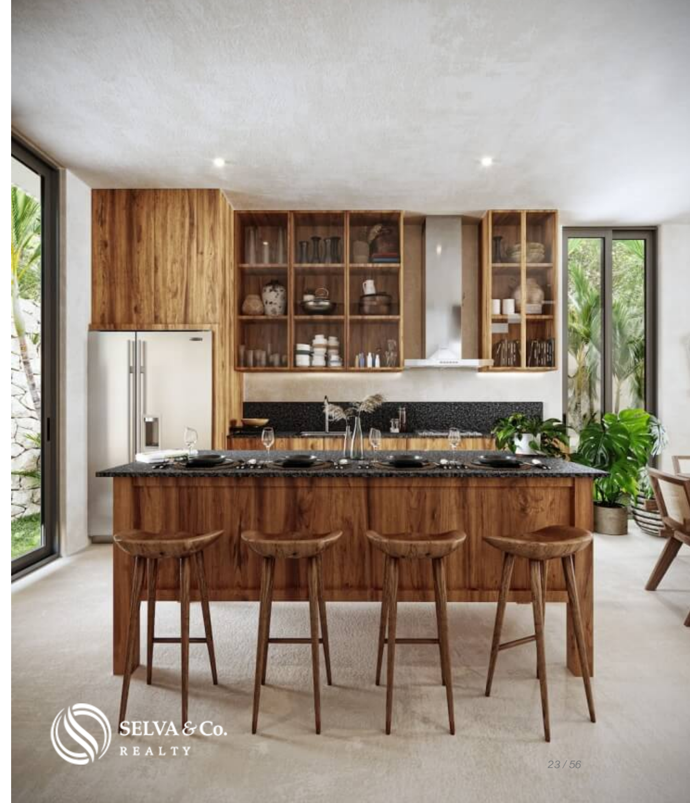
Cocina con barra desayunadora Kitchen with breakfast bar