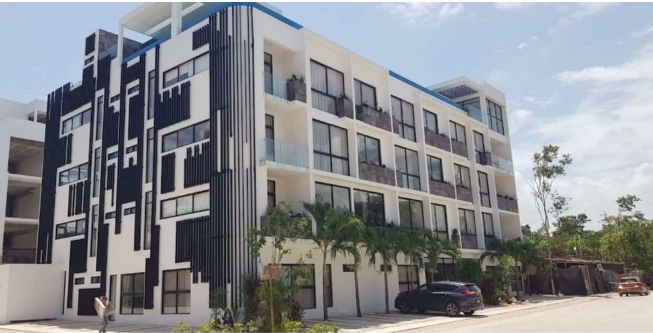
Edificio moderno - Modern building