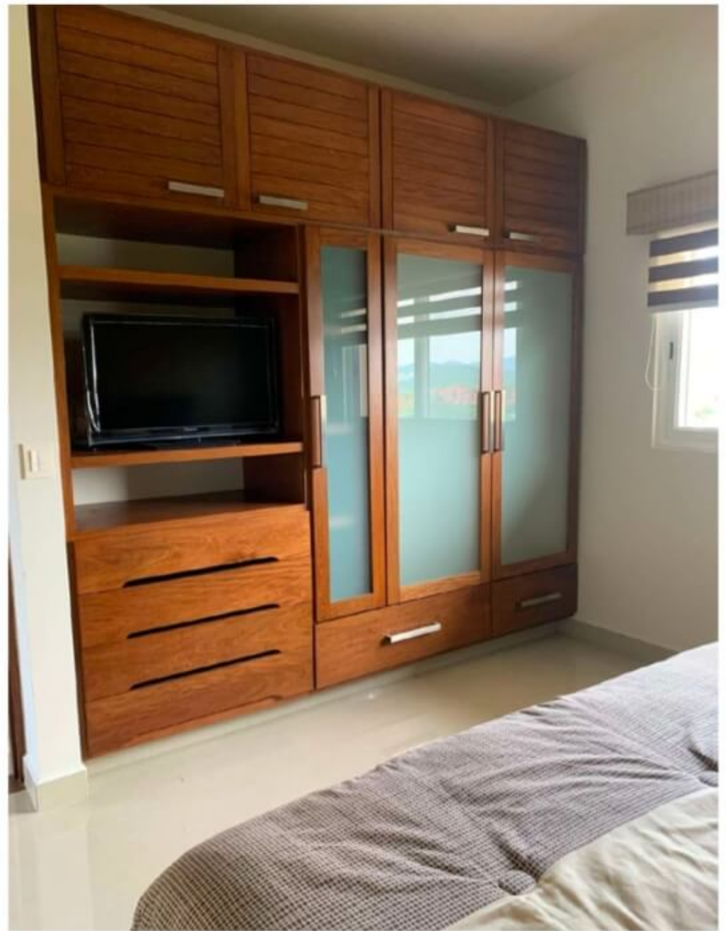
Recamara secundaria Secondary bedroom