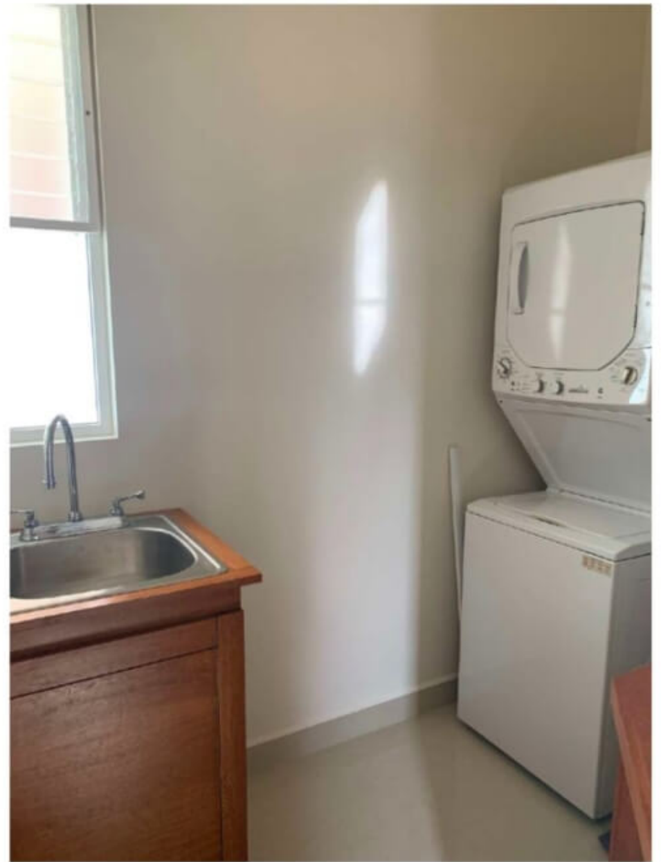
Area de lavanderia Laundry room