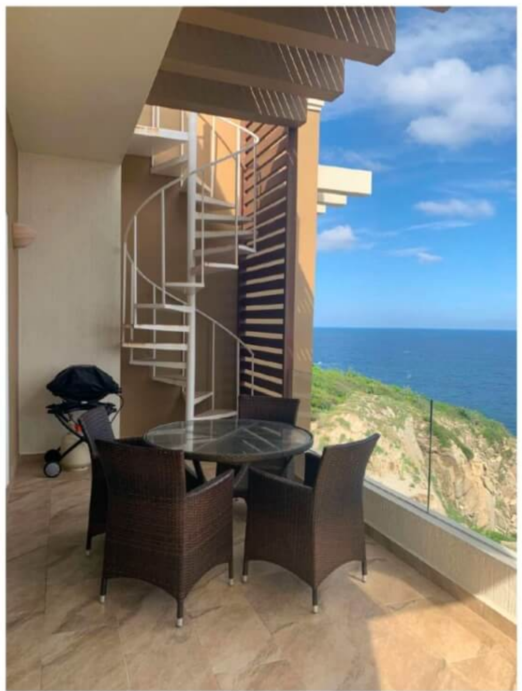
Terraza de planta baja con vista al mar Ground floor ocean view terrace