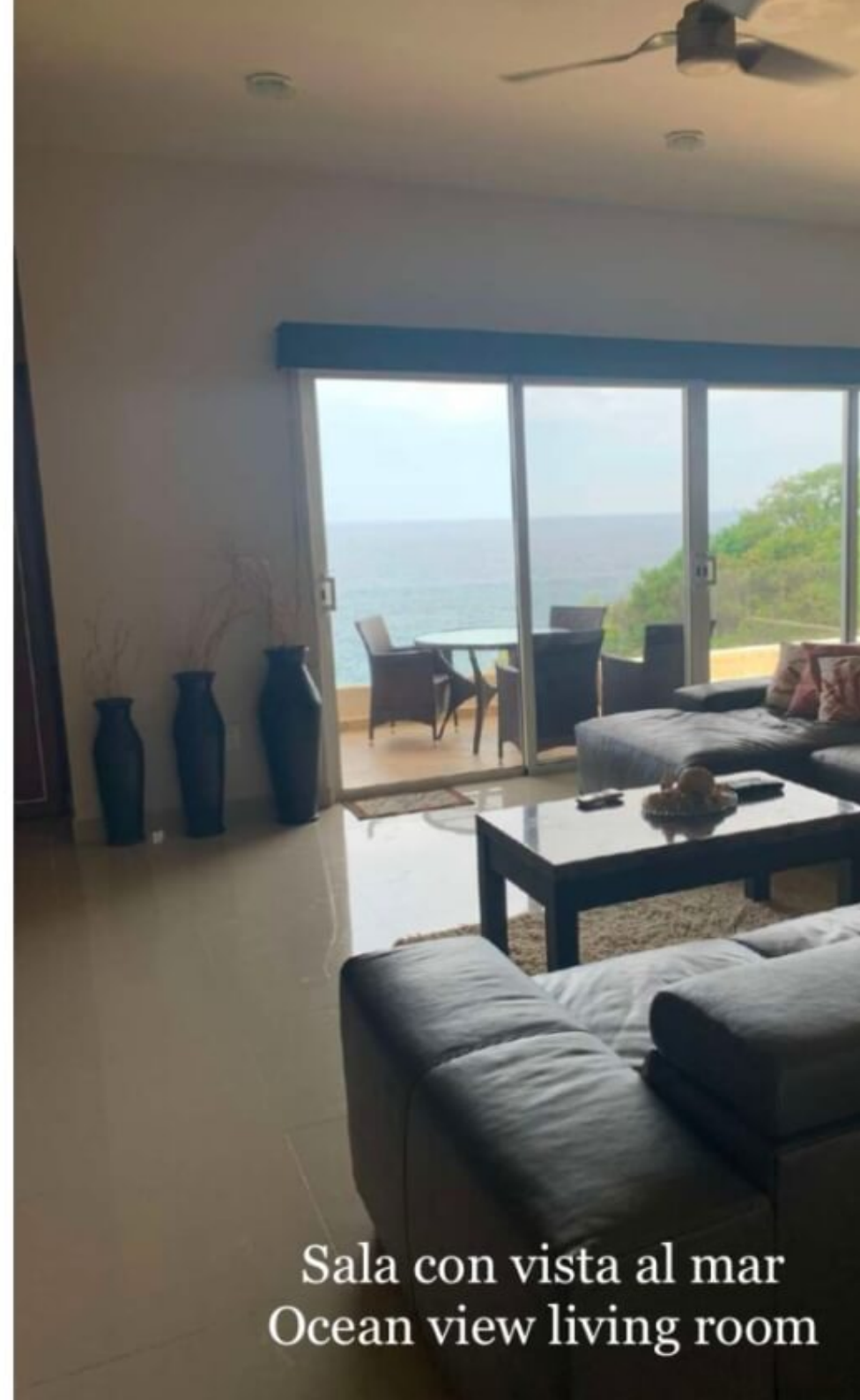
Sala con vista al mar Ocean view living room