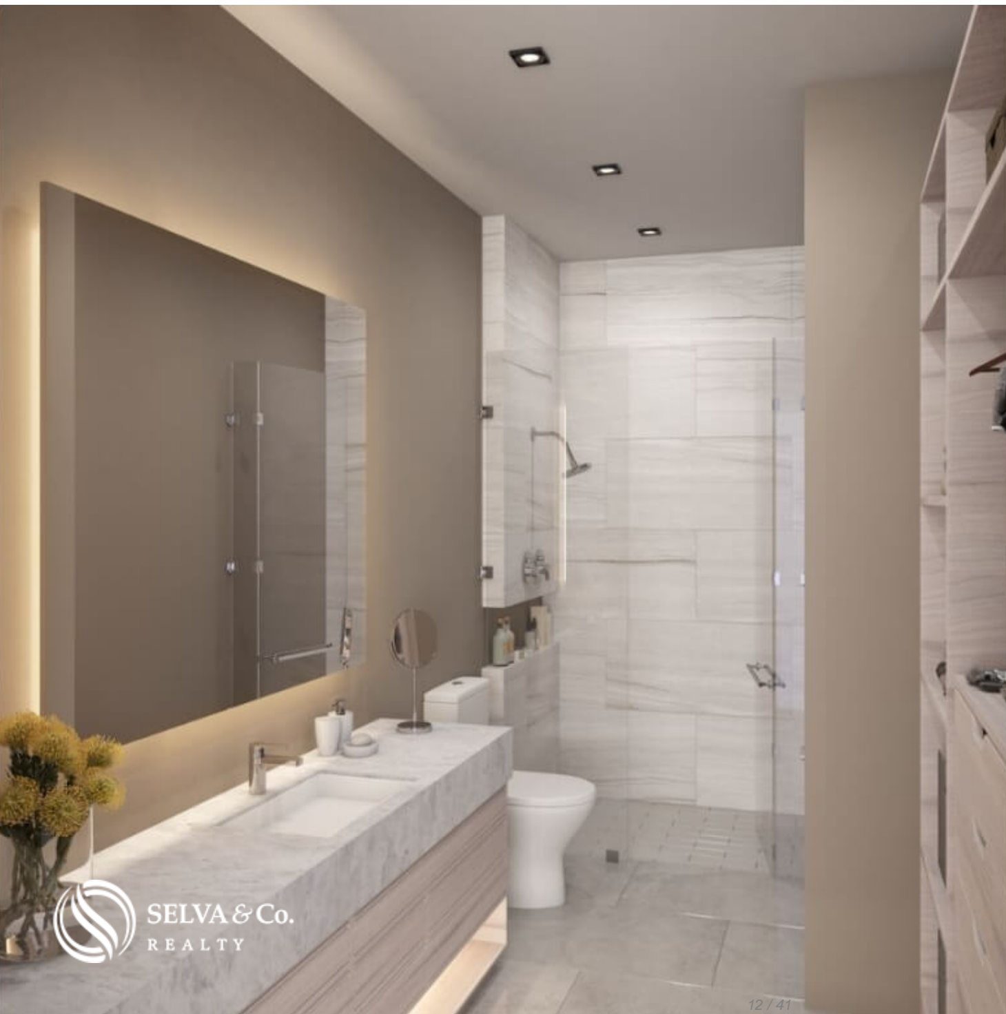
Baño moderno Modern style bathroom