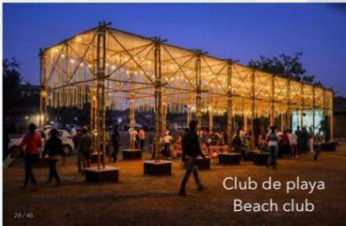
Club de playa Beach club