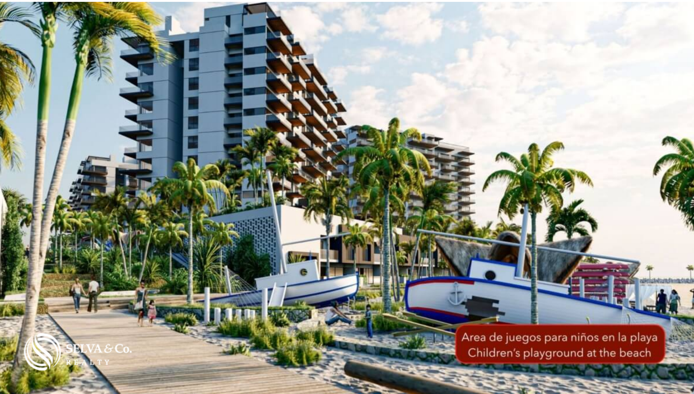
Area de juegos para niños en la playa Children's playground at the beach