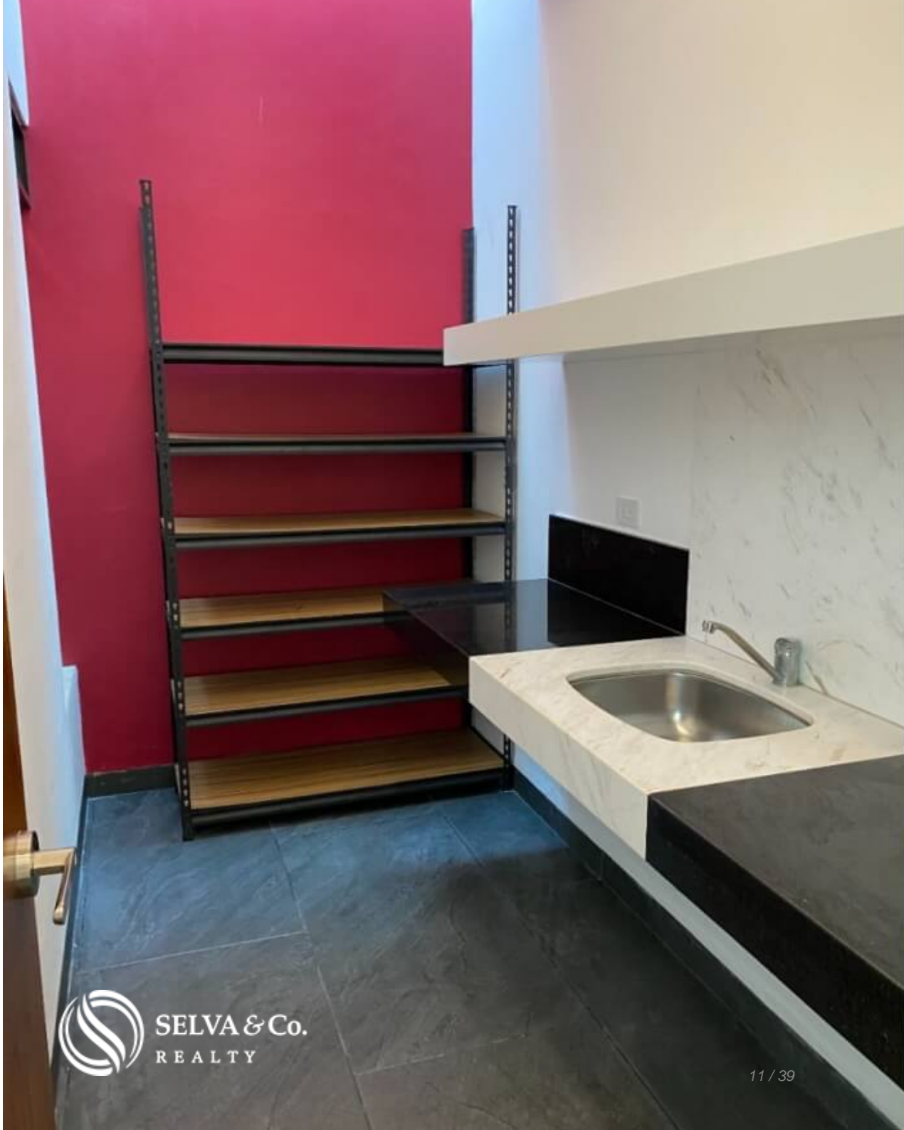
Area de lavandería y bodega Laundry room-storage